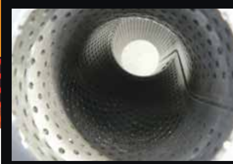
Perforated tube high flow muffler internals supported with a case stiffener.