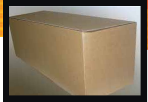
All components are boxed for undamaged delivery.