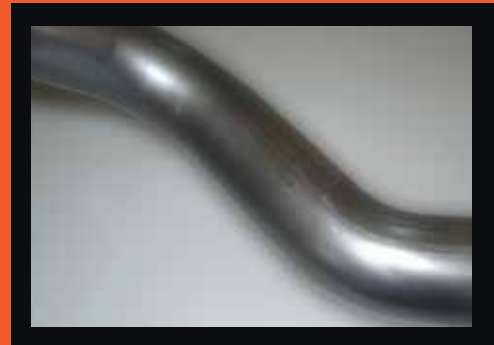
3 inch mandrel bent tube for maximum gas flow & performance.