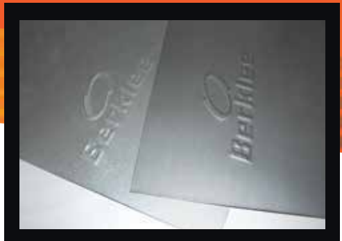
Available in 409 stainless steel or aluminised steel.