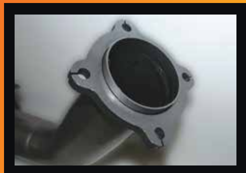
10mm thick 4 bolt pipe through flange design for perfect fitment accuracy.