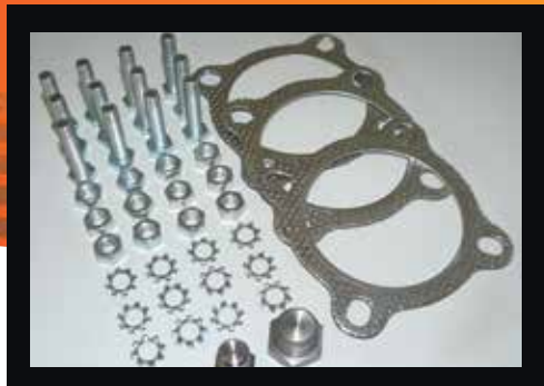
Installation kit includes gaskets, bolts & nuts.