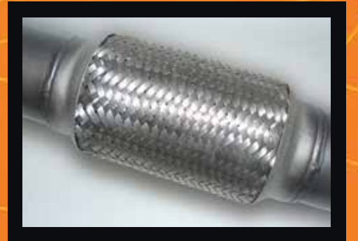
Double braided stainless steel flex joints.