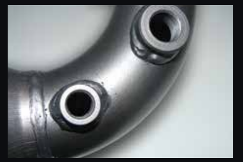
Large diameter turbo dump pipe incorporating EGT (1/4" BSP) & O2 (18mm x 1.5mm Pitch) sensor fittings.