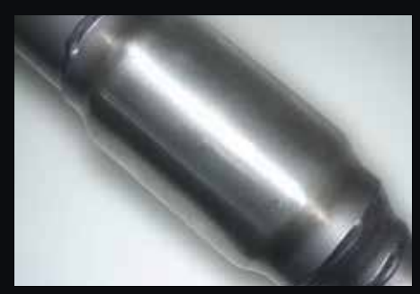
Euro 3 diesel high flow 200 CPI metallic substrate catalytic converter.