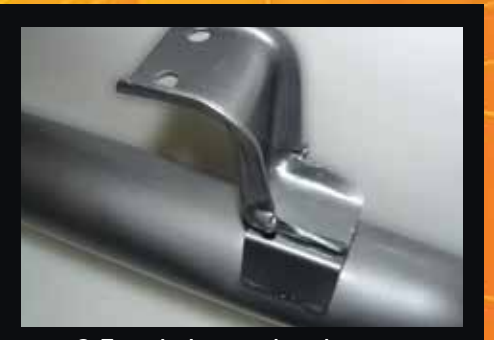
O.E. style heavy duty hangers and brackets connect to all orginal mounting points on vehicle.