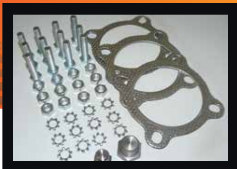
Installation kit includes gaskets, bolts & nuts.