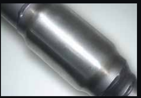
Euro 3 diesel high flow 200 CPI metallic substrate catalytic convert-