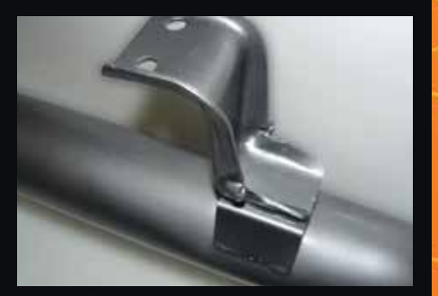
O.E. style heavy duty hangers and brackets connect to all orginal mounting points on vehicle.