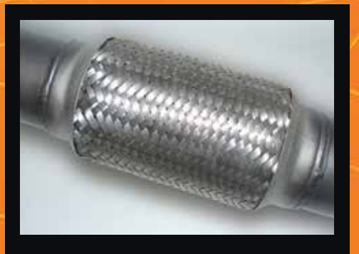
Double braided stainless steel flex joints.