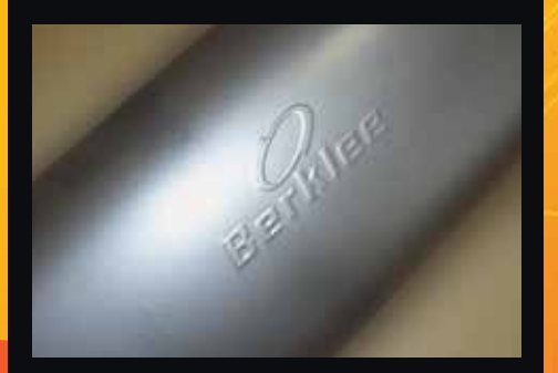
100% Australian made & owned for over 5 decades.