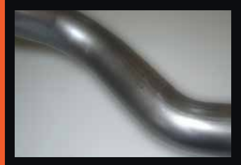
3 inch mandrel bent tube for maximum gas flow & performance.