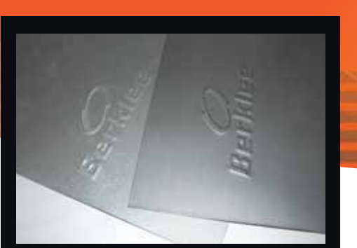
Available in 409 stainless steel or aluminised steel.