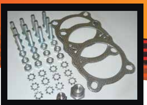
Installation kit includes gaskets, bolts & nuts.