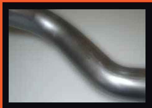
3 inch mandrel bent tube for maximum gas flow & performance.