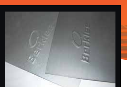
Available in 409 stainless steel or aluminised steel.