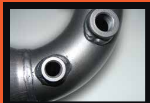
Large diameter turbo dump pipe incorporating EGT (1/4" BSP) & O2 (18mm x 1.5mm Pitch) sensor fittings.