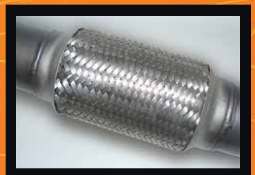
Double braided stainless steel flex joints.