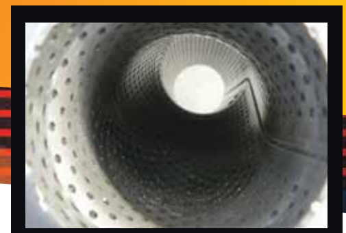
Perforated tube high flow muffler internals supported with a case stiffener.