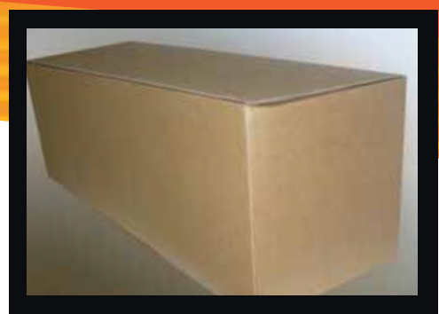
All components are boxed for undamaged delivery.