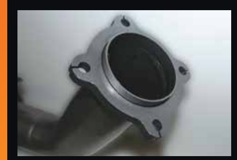
I Omm thick 4 bolt pipe through flange design for perfect fitment accuracy.