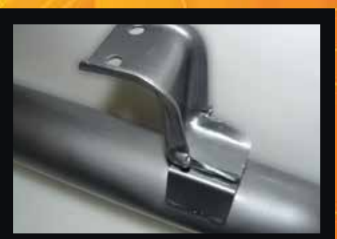
O.E. style heavy duty hangers and brackets connect to all orginal mounting points on vehicle.