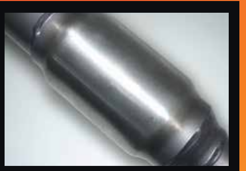
Euro 3 diesel high flow 200 CPI metallic substrate catalytic converter.