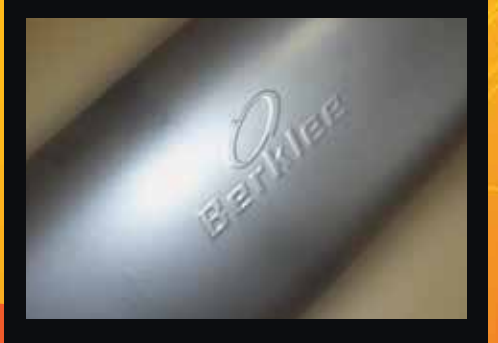
100% Australian made & owned for over 5 decades.

Email: sales@berkleeshop.com.au Phone: 0418 456 371