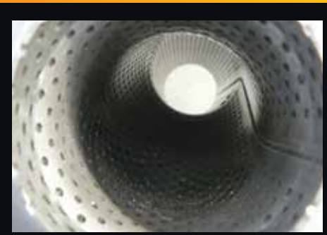
Perforated tube high flow muffler internals supported with a case stiffener.