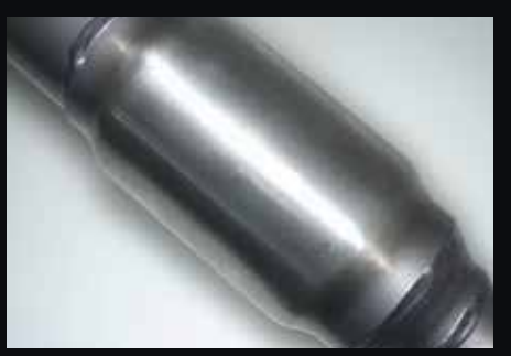
Euro 3 diesel high flow 200 CPI metallic substrate catalytic converter.