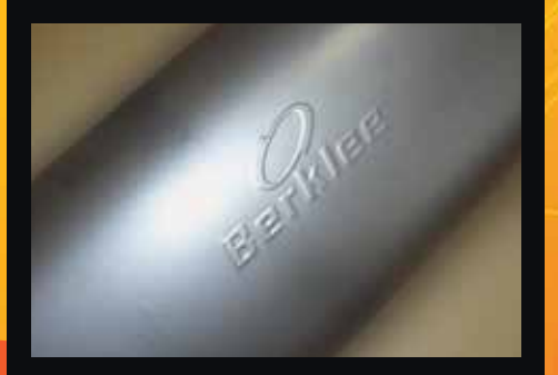
100% Australian made & owned for over 5 decades.

Email: sales@berkleeshop.com.au Phone: 0418 456 371