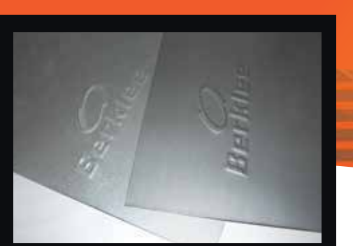
Available in 409 stainless steel or aluminised steel.