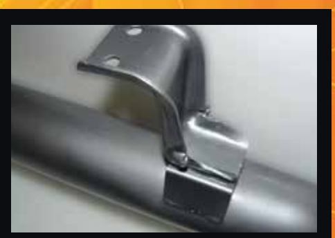
O.E. style heavy duty hangers and brackets connect to all orginal mounting points on vehicle.