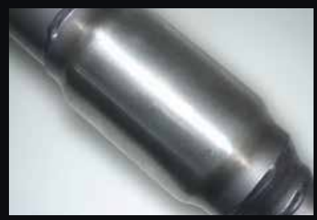
Euro 3 diesel high flow 200 CPI metallic substrate catalytic convert-