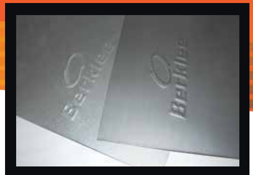
Available in 409 stainless steel or aluminised steel.