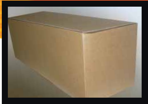
All components are boxed for undamaged delivery.