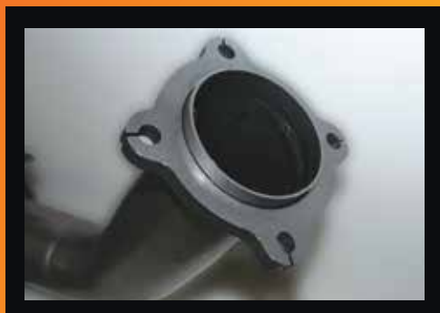
10mm thick 4 bolt pipe through flange design for perfect fitment accuracy.