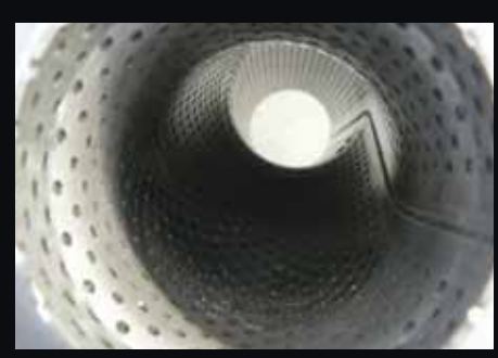
Perforated tube high flow muffler internals supported with a case stiffener.