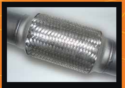
Double braided stainless steel flex joints.