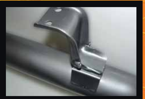
O.E. style heavy duty hangers and brackets connect to all orginal mounting points on vehicle.