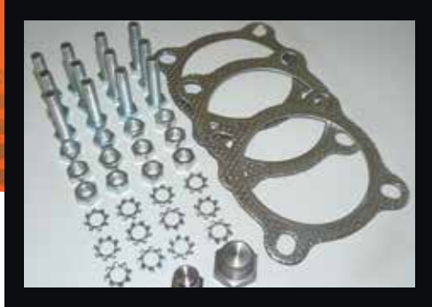
Installation kit includes gaskets, bolts & nuts.