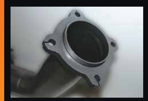
I Omm thick 4 bolt pipe through flange design for perfect fitment accuracy.