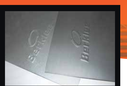
Available in 409 stainless steel or aluminised steel.

All components are boxed for undamaged delivery.