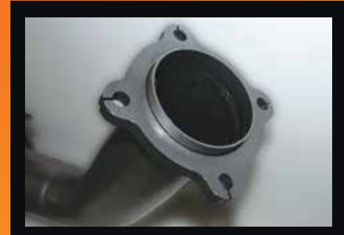
10mm thick 4 bolt pipe through flange design for perfect fitment accuracy.