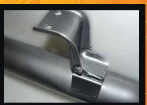
O.E. style heavy duty hangers and brackets connect to all orginal mounting points on vehicle.