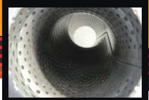
Perforated tube high flow muffler internals supported with a case stiffener.