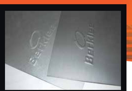
Available in 409 stainless steel or aluminised steel.