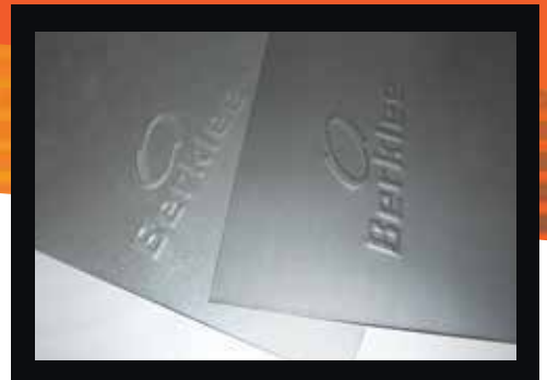
Available in 409 stainless steel or aluminised steel.