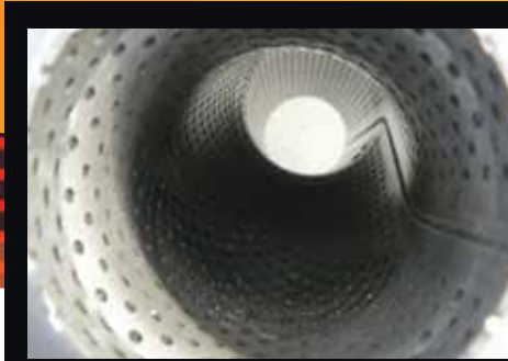
Perforated tube high flow muffler internals supported with a case stiffener.