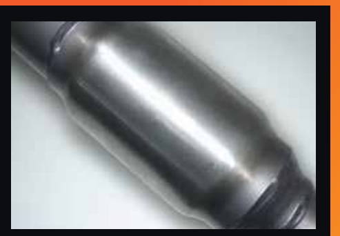
Euro 3 diesel high flow 200 CPI metallic substrate catalytic converter.