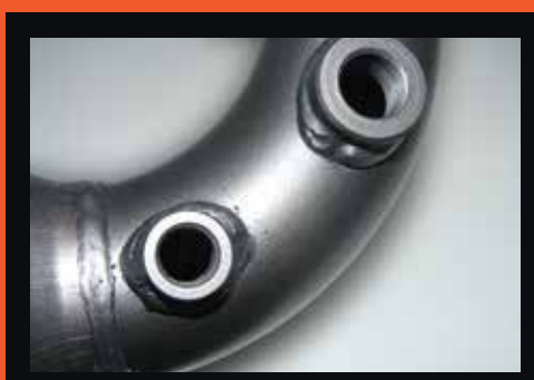
Large diameter turbo dump pipe incorporating EGT (1/4" BSP) & O2 (18mm x 1.5mm Pitch) sensor fittings.