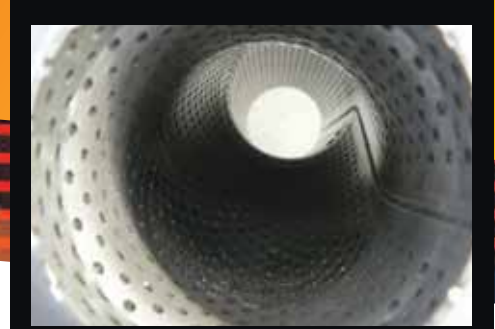
Perforated tube high flow muffler internals supported with a case stiffener.