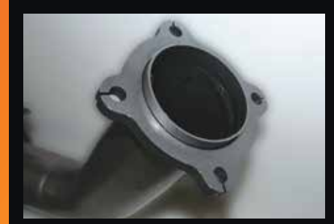
I Omm thick 4 bolt pipe through flange design for perfect fitment accuracy.