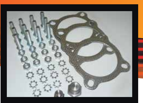
Installation kit includes gaskets, bolts & nuts.