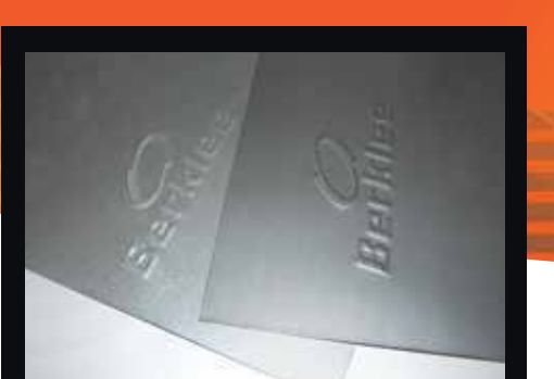
Available in 409 stainless steel or aluminised steel.