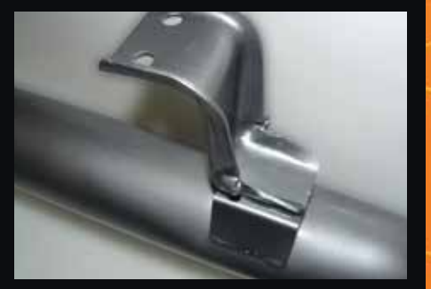
O.E. style heavy duty hangers and brackets connect to all orginal mounting points on vehicle.