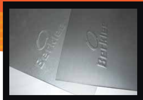
Available in 409 stainless steel or aluminised steel.