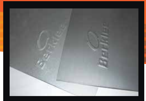
Available in 409 stainless steel or aluminised steel.