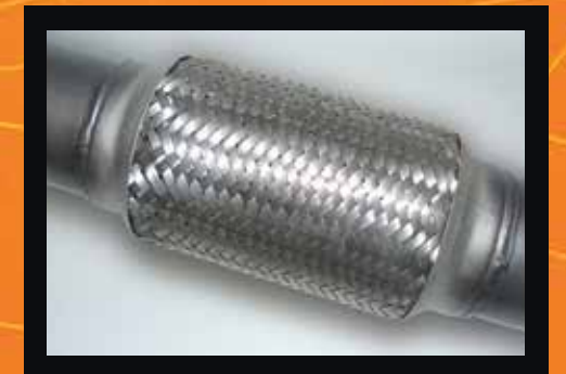
Double braided stainless steel flex joints.