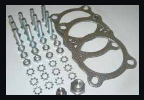
Installation kit includes gaskets, bolts & nuts.