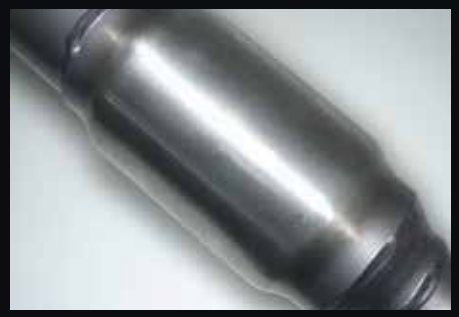
Euro 3 diesel high flow 200 CPI metallic substrate catalytic converter.