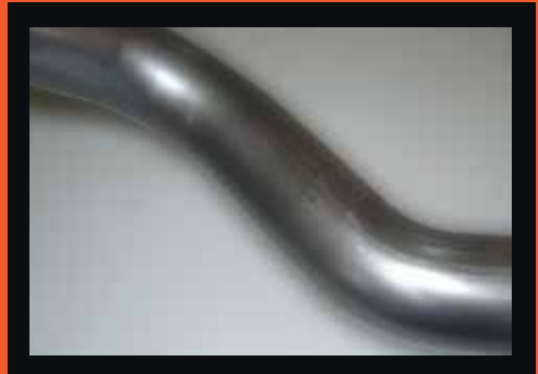
3 inch mandrel bent tube for maximum gas flow & performance.