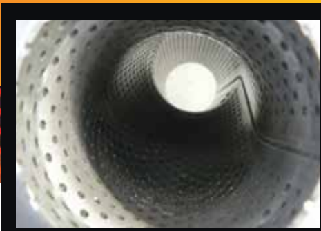
Perforated tube high flow muffler internals supported with a case stiffener.