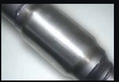
Euro 3 diesel high flow 200 CPI metallic substrate catalytic converter.