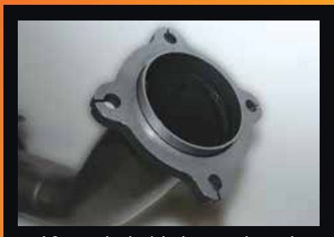
10mm thick 4 bolt pipe through flange design for perfect fitment accuracy.