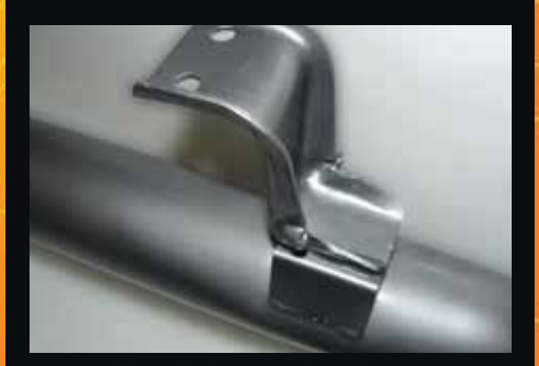
O.E. style heavy duty hangers and brackets connect to all orginal mounting points on vehicle.