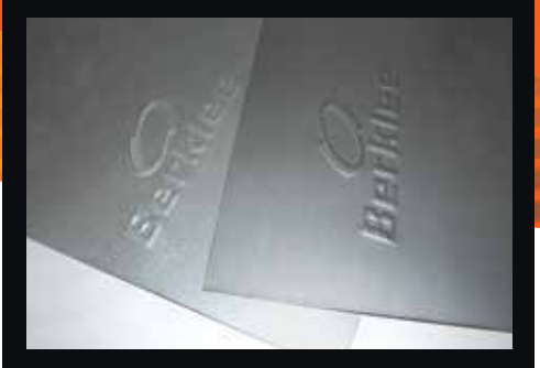
Available in 409 stainless steel or aluminised steel.