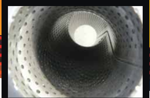
Perforated tube high flow muffler internals supported with a case stiffener.