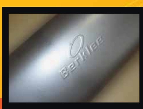
100% Australian made & owned for over 5 decades.

Email: sales@berkleeshop.com.au Phone: 0418 456 371