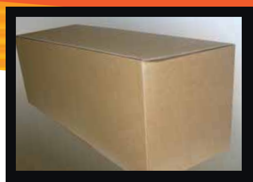
All components are boxed for undamaged delivery.