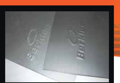
Available in 409 stainless steel or aluminised steel.