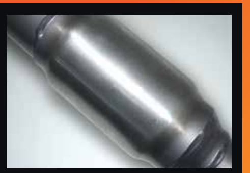
Euro 3 diesel high flow 200 CPI metallic substrate catalytic converter.