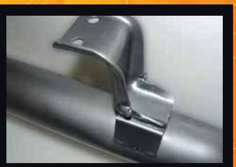
O.E. style heavy duty hangers and brackets connect to all orginal mounting points on vehicle.